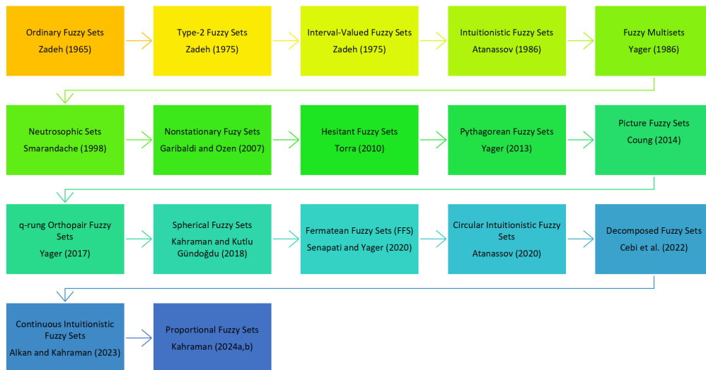
Figure 1. Extensions of ordinary fuzzy sets.

their sum can be at most 3. Coung [4] introduced picture fuzzy sets (PiFS) with three parameters which are called yes, no, and abstain and their complement to one as refusal degree. Kahraman et al. [7] introduced spherical fuzzy sets (SFS) which the squared sum of the same parameters as picture fuzzy sets can be at most equal to one. Later, some more recent extensions have been introduced to the literature such as circular intuitionistic fuzzy sets [2], decomposed fuzzy sets [15], continuous intuitionistic fuzzy sets [16], and proportional fuzzy sets [5, 6]. Figure 1 shows the history of ordinary fuzzy set extensions in the literature.